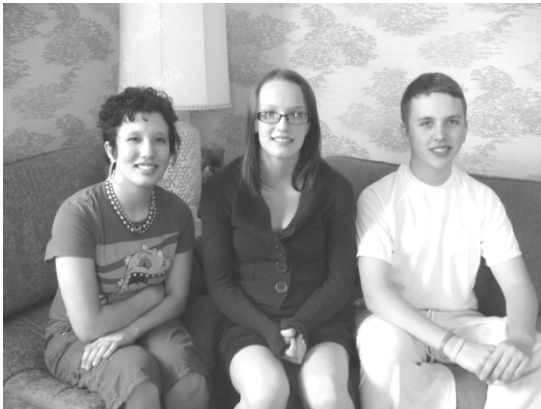
Spokane students prepare for their trip to Japan.